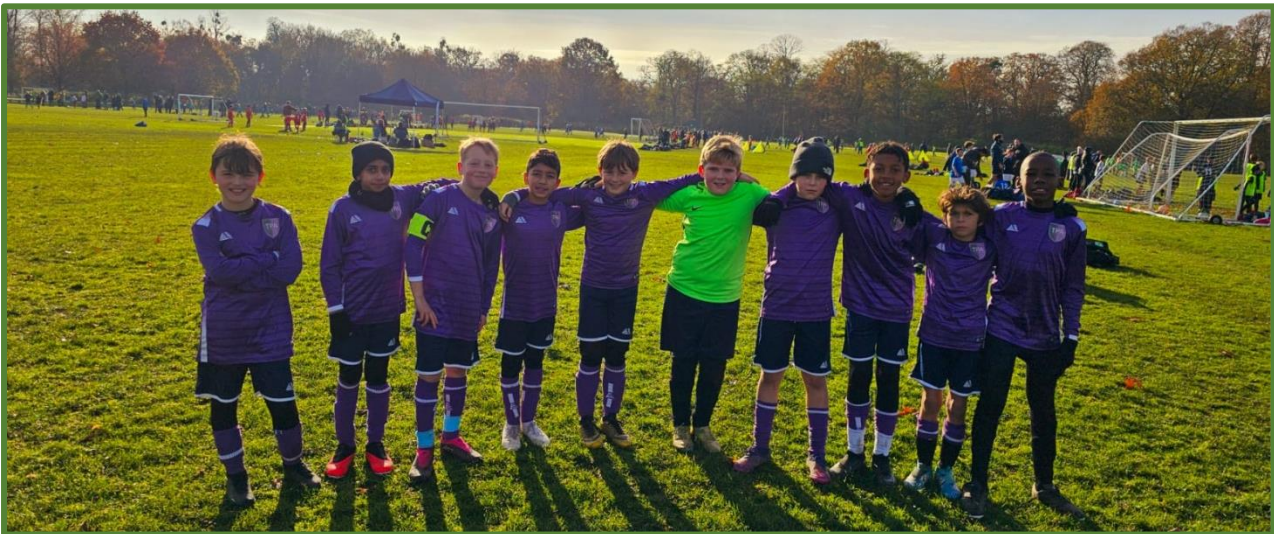
TPA Year 5 & 6 Football – Richmond Football Tournament