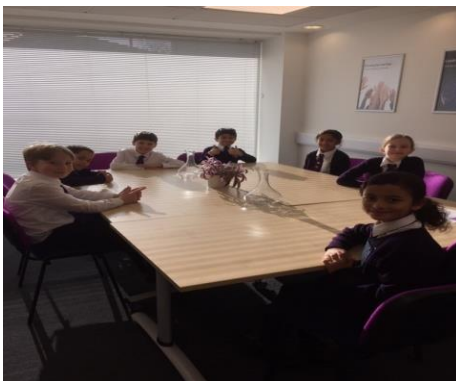
The House Captains Planning House Day for February 14 th 2020

Just a reminder, that if your child does not have a house t shirt, you will need to purchase this for the House Day. You can purchase these from Stevenson if required. Please check with the class teacher or school office if you are unsure which house your child is in.